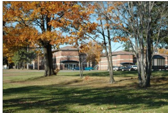
Clinton Community College formerly owned two residence halls which were sold in June 2019

fire: 0 The number of injuries related to fire that resulted in treatment at a medical facility: 0 The value of property damage related to fire: 0