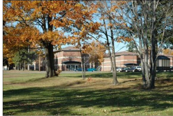
Clinton Community College formerly owned two residence halls which were sold in June 2019

fire: 0 The number of injuries related to fire that resulted in treatment at a medical facility: 0 The value of property damage related to fire: 0