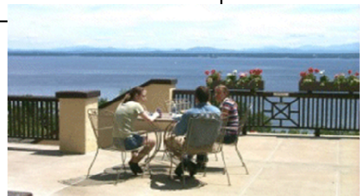
Clinton Community College Reporting Locations

students who are “at risk” for continued behavioral or academic issues to and develop strategies to discuss issues of concern with students and to support the student in achieving success while at Clinton. Specifically, this group will intervene early with students who are at risk; watch for information, both oral and written, from faculty and staff about behavior that may be threatening; stay attuned to escalating behavior or potential physical violence; and develop a plan of action for the student such as contacting parents, referrals to various campus and off-campus resources, or disciplinary action as appropriate.