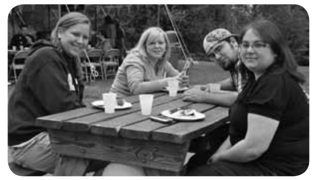
2010 New Alumni Block Party.