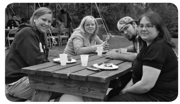
2010 New Alumni Block Party.