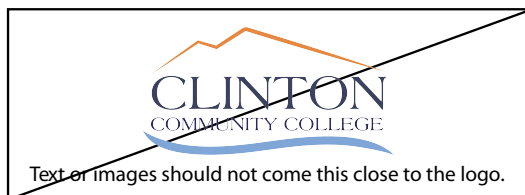
Text or images should not come this close to the logo.